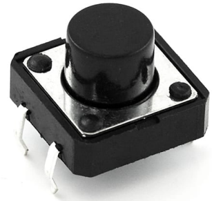
×1 مفتاح تحكم