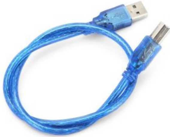
×1 سلك الوردينو