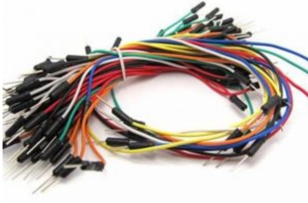
حزمة أسلاك توصيل (ذكر - ذكر)